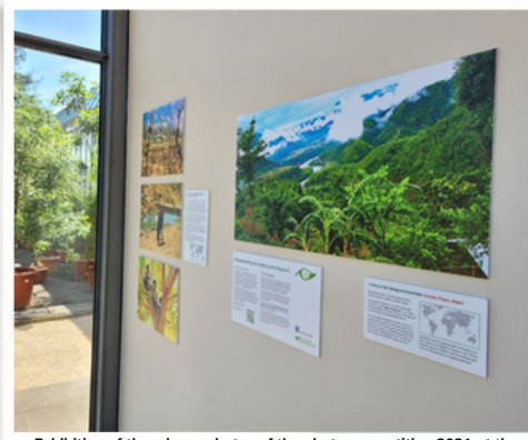
Exhibition of the winner photos of the photo competition 2021 at the Botanical Garden

To ensure further success of our ongoing projects but also to conduct new projects, Let's Plant is looking for new members and people who want to help us on a voluntary basis to accomplish our aims. At the moment, we especially need assistance in our marketing and fundraising activities as well as in the development and management of a new project in Ethiopia that we are currently planning. If either of these is interesting for you or if you want further information about our NGO, our projects, the new project in Ethiopia or if you have ideas for other projects in different countries that you would like to implement, feel free to contact me, Dominik Suri (dominik.suri@lets-plant.org), or reach out to me if you see me on campus.